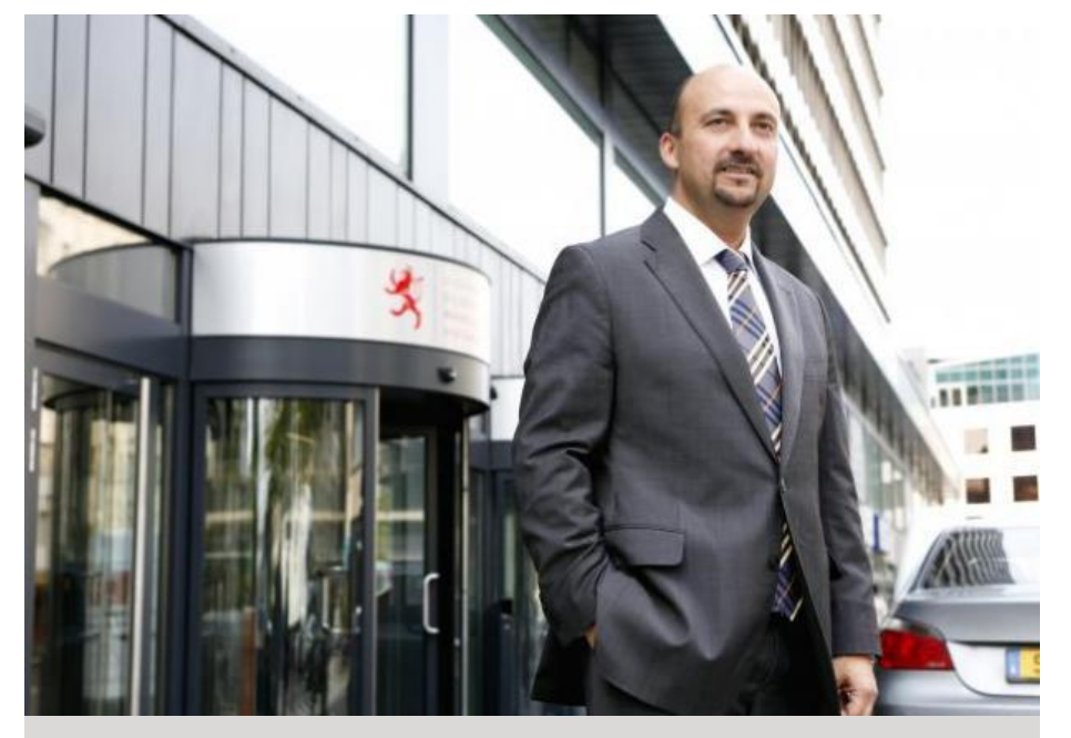
Etienne Schneider in front of the economy ministry

Oil and water don't mix | DELANO 23.01.14 13:37