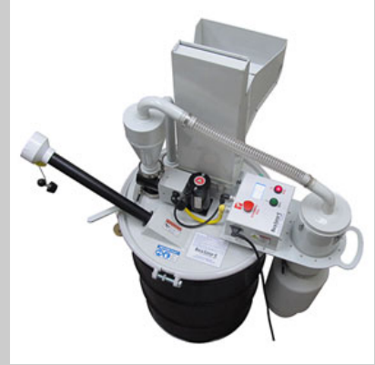
The Bulb Eater® 3 with Intelli Technology more products